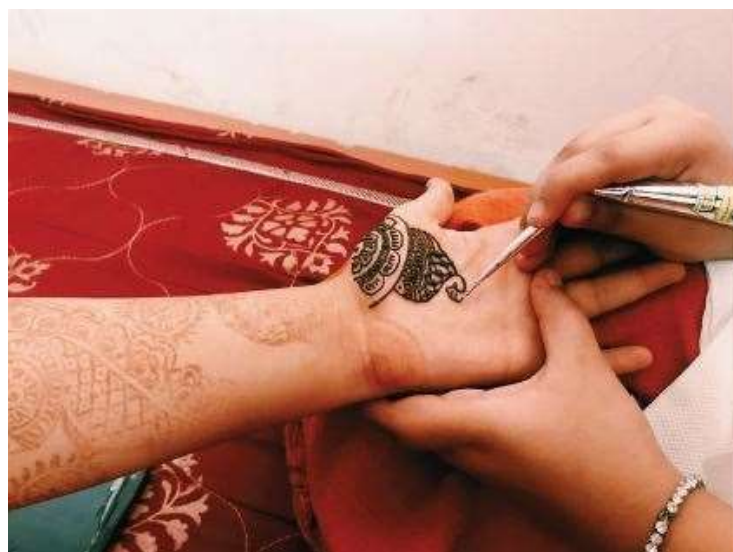
The Mehendi stall put up by members of the art club