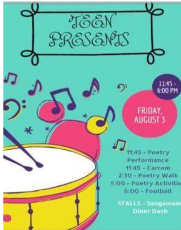
Posters for the event with the schedule for each day.