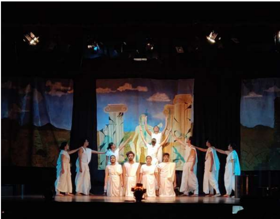
A scene from the play, Oedipus Rex performed by students.