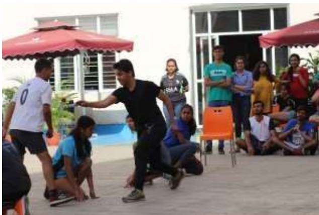
Scenes from the kho-kho and basketball competitions