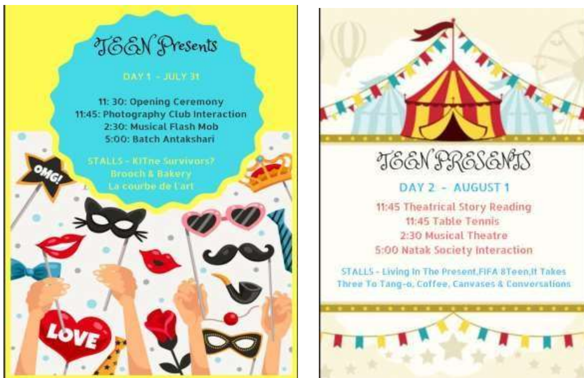
Posters for the event with the schedule for each day.

The Opening Ceremony of Teen was held at 11:30 am in the common area which was followed by an interaction with the photography club, a musical flash mob and an inter-batch antakshari. Similarly events were planned on all six days of the festival.