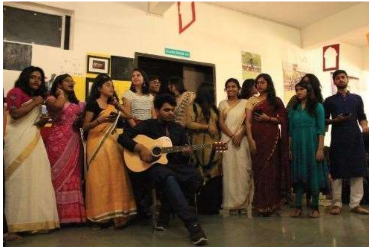
The music club performs a medley of traditional songs

The annual Traditional Day is one of the most anticipated college events of the year. Students all dressed in traditional clothes while various clubs organized special events on November 19. The photography club organised an exhibition for photographs of all the things that mean home, while the art club helmed a Mehendi Stall. The dance and music clubs performed wonderful medleys and the poetry club brought in some lovely multi-lingual performances that echoed through the corridors. Evening saw everybody bring out their finery and dance until they couldn't anymore, and the night ended with sweaty, happy faces.