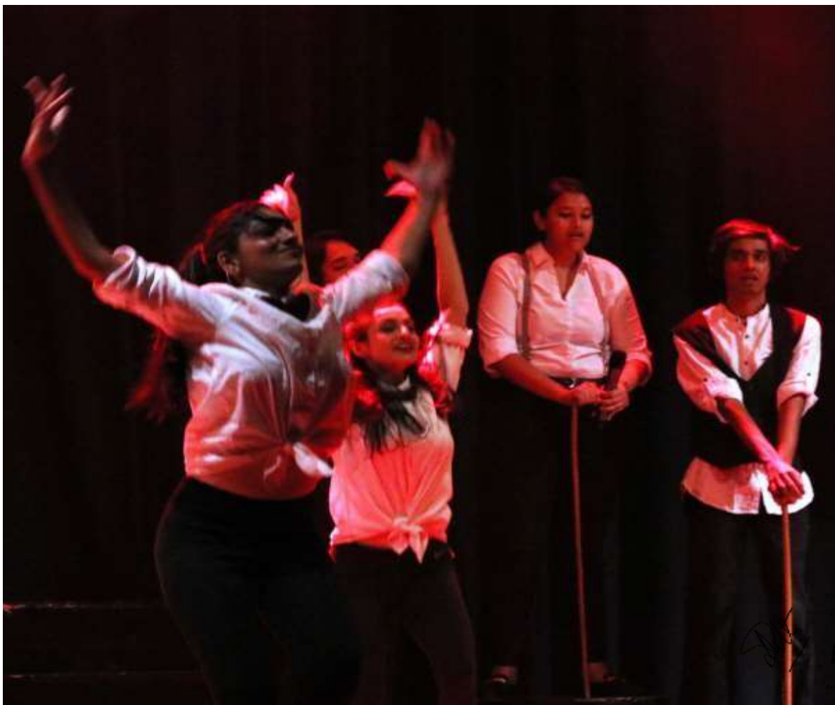
The dance club performance at Red Carpet